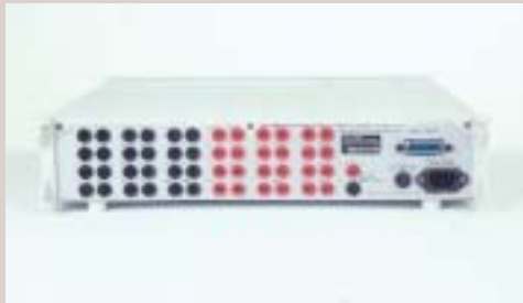
Fully loaded 948i shown with six HV-8 switching cards installed - to form a 2x24 high voltage matrix.

Configuration: 4 channels of high-current relays and 4 channels of sense relays