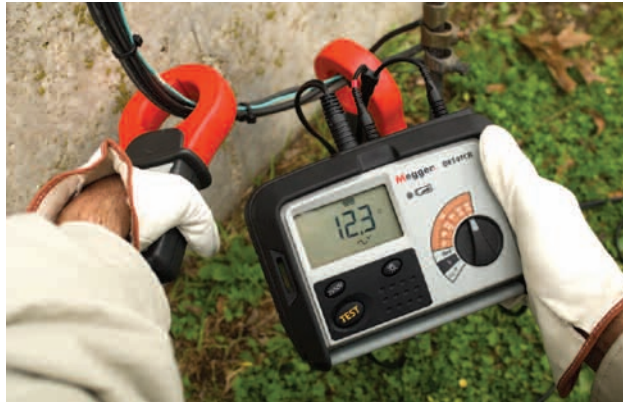
Model DET4TCR shown performing the stakeless ground testing method using only clamps.

connection and conditions of the P spike, C spike, and also the level of ground noise, indicating the status on the display. (The analog model allows the operator to check the condition of the spikes). The instruments also include a voltmeter to enable measurement of ground voltage. Four of the models (the DET3TD, 3TA, 3TC and 4TD) can measure resistance from 0.01 ohms to 2 kΩ, while the DET4TC and 4TCR can measure resistance from 0.01 ohms to 20 kΩ. Also, to allow accurate testing in noisy environments, the instruments are capable of rejecting noise up to 40V peak to peak.