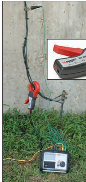
Current measuring clamp (inset) for ART testing capability

lifting the utility connection, yet with the ease, reliability and confidence of a separate commissioning test.