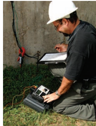
Using ART method with the DET3TC to test commercial ground without disconnecting the system

With this added function, on-site grounds can be tested separately without having to remove the utility connection (as explained further in this document). The new DET4TC and 4TCR also provides a stakeless testing technique. It allows the operator to use the instrument