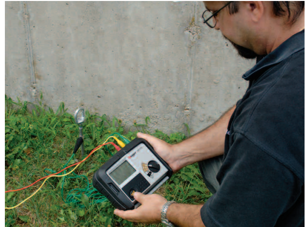
Model DET3TD shown performing the classic fall-of-potential test method.

method with ART (Attached Rod Technique), which allows electrode testing without disconnection and also leakage current measurements down to 0.5 mA. A second optional clamp, the VCLAMP, enables true stakeless measurements to be made in situations where driving stakes is not practical.