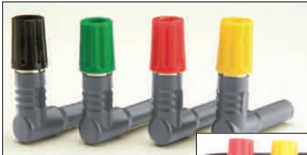
Terminal Adapters are optional accessories used to allow the DET3 and DET4 Series units' terminals to accept alternative cable connections.