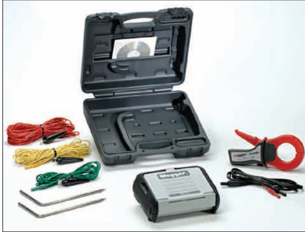
Each instrument comes complete with three sets of leads, two test spikes, instruction manual CD, and a rugged carrying case, (current measuring clamp, shown, is an optional accessory for performing the ART testing capability using the DET3TC, DET4TC and DET4TCR only.)