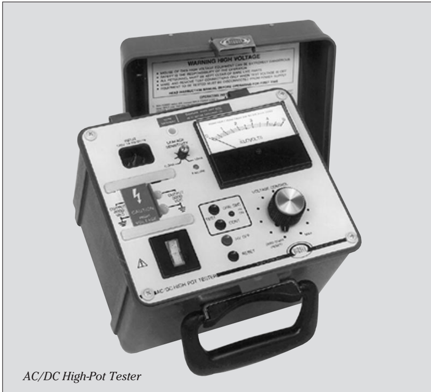
AC/DC High-Pot Tester