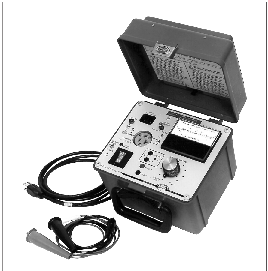
AC High-Pot Tester with supplied leads

Order Megger Electrical Safety Test Products~ Stocking Distributor http://www.Atequip.com ~ Same Day Shipments ~ 858-756-8742 ~ sales@ATEquip ~ Special Discount Pricing Credit Cards Accepted