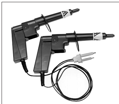
Optional pistol-grip leads