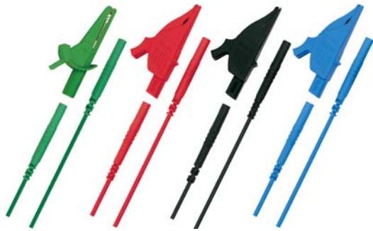
Leads are included with Model AN-1